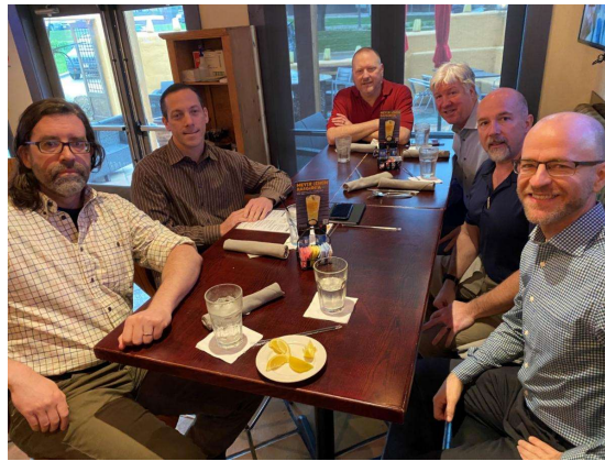
Cyber Committee - March 14, 2020