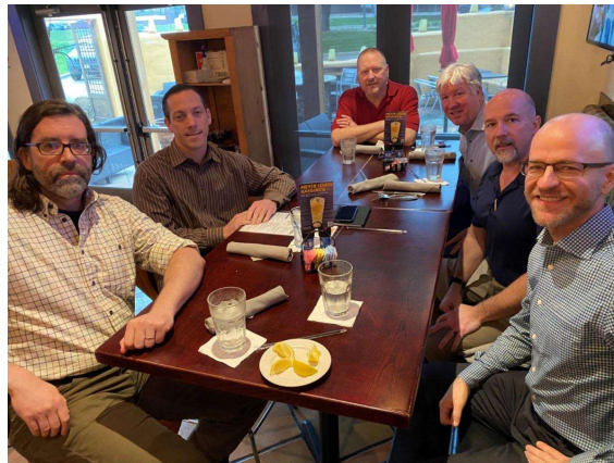
Cyber Committee - March 14, 2020